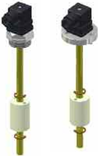
LET 1 Float + Thermostat