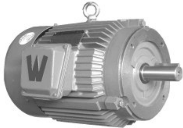
C-Flange Mount Round Body

Explosion-Proof C-Flange Mount Motors Now Available!